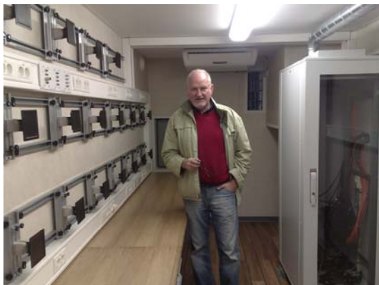
Control room module