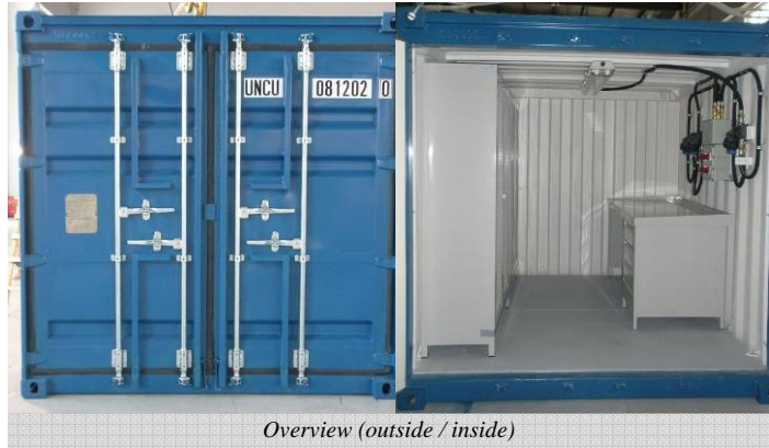
Overview (outside / inside)