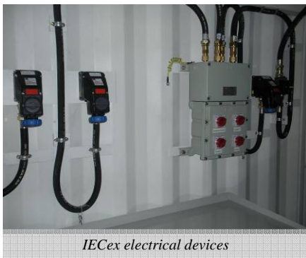
IECex electrical devices