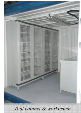
Tool cabinet & workbench

(Other equipment can be installed on request)