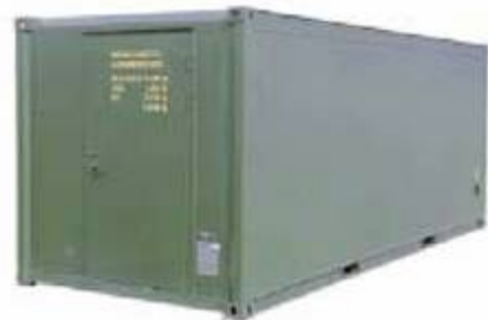
20' shelter configured for mobilization onto a Standard Logistics Truck.