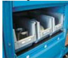
Equipment in system.