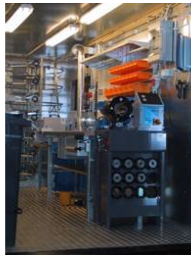
Fixture and fittings must be in highest quality to provide a reliable working environment.