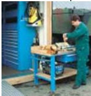
In work outside the workshop.