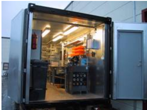
One edition of Uniteams Workshop Container.

Uniteam have delivered several solutions on workshops. Similar workshop shelters are in operational use with the armed forces of Norway, Sweden, Denmark, The Netherlands as well as NATO and The United Nations.